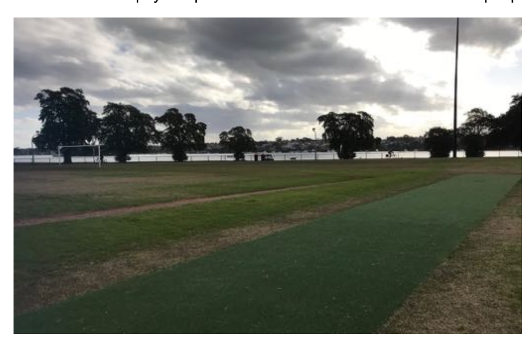
IRON COVE FROM WATERFRONT OVAL, CALLAN PARK ROZELLE

The "Eora people" was the name given to coastal Aborigines around Sydney - Eora means "from this place" - local Aboriginal people used this word to describe to Europeans where they came from, and in time the term became used to define Aboriginal people themselves. Wangal country was known as wanne and it originally extended from the suburbs of Balmain and Birchgrove in the east to Silverwater and Auburn in the west. We pay Respect to their forebears and those current peoples.