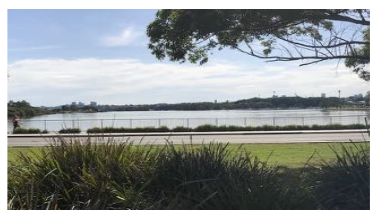
IRON COVE FROM TIMBRELL PARK, FIVE DOCK