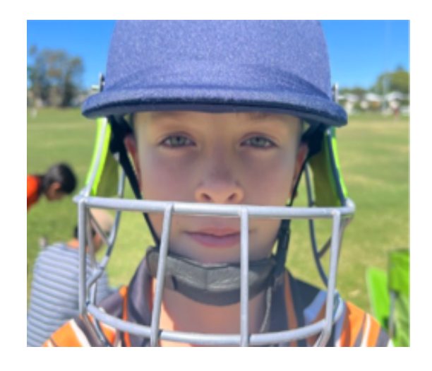
Best part of this season - 'hitting runs'