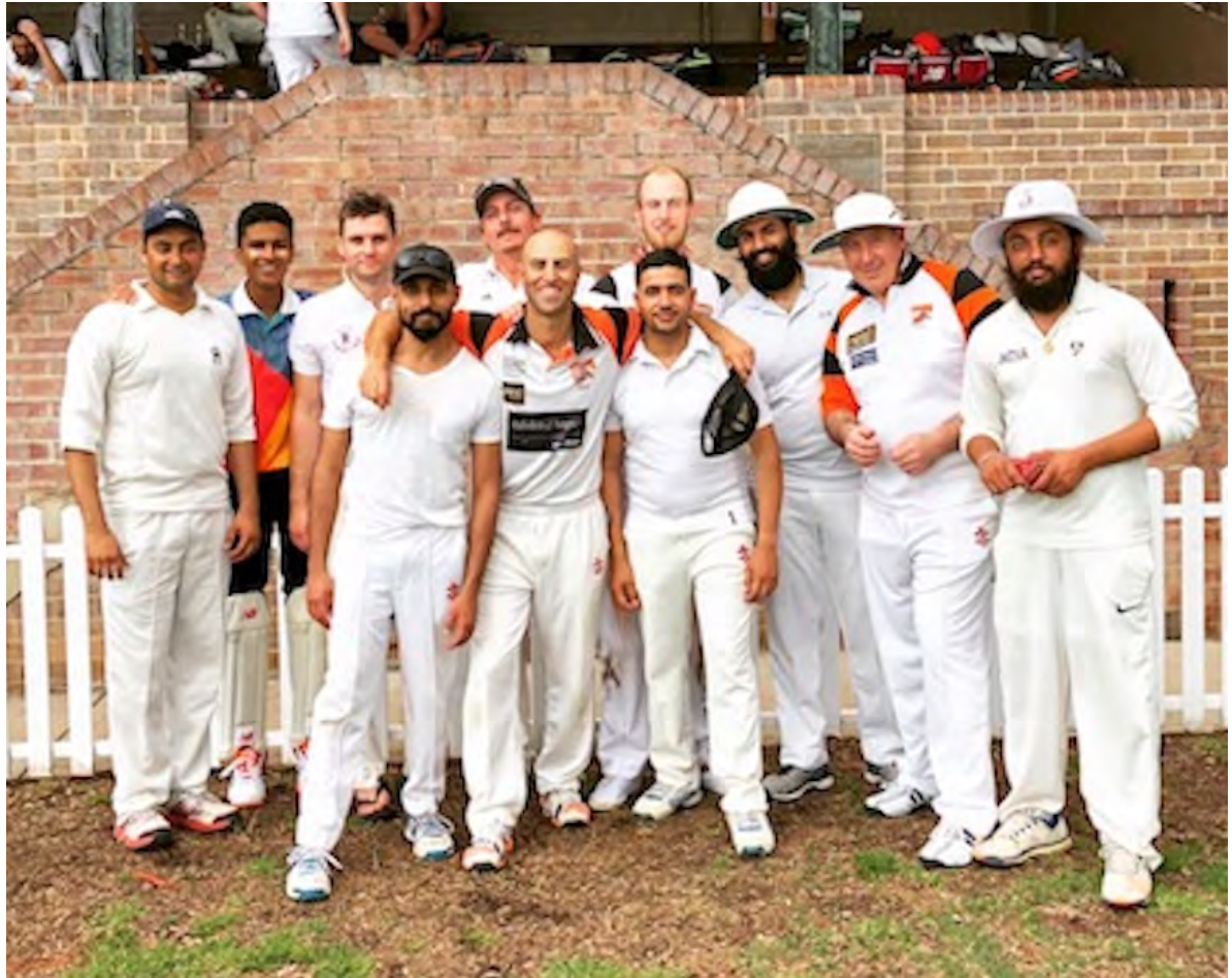
A/B GRADE TIGERS 1 AT MONASH PARK AFTER BEATING GLADESVILLE SPORTIES