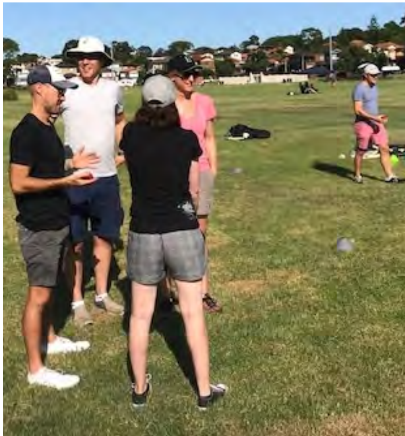
JUNIOR BLASTER PARENTS