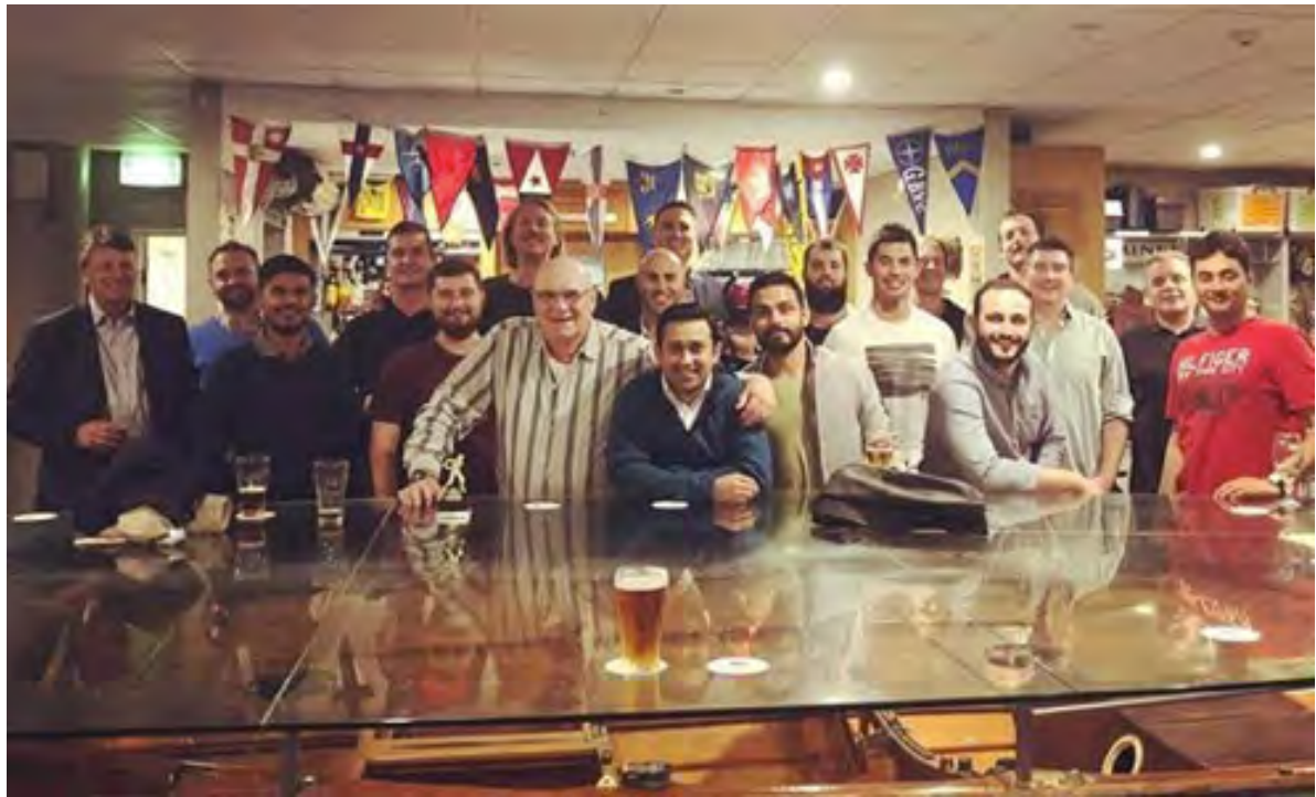
IRON COVE TIGERS LAUNCH SEPTEMBER 2018 AT DRUMMOYNE SAILING CLUB.