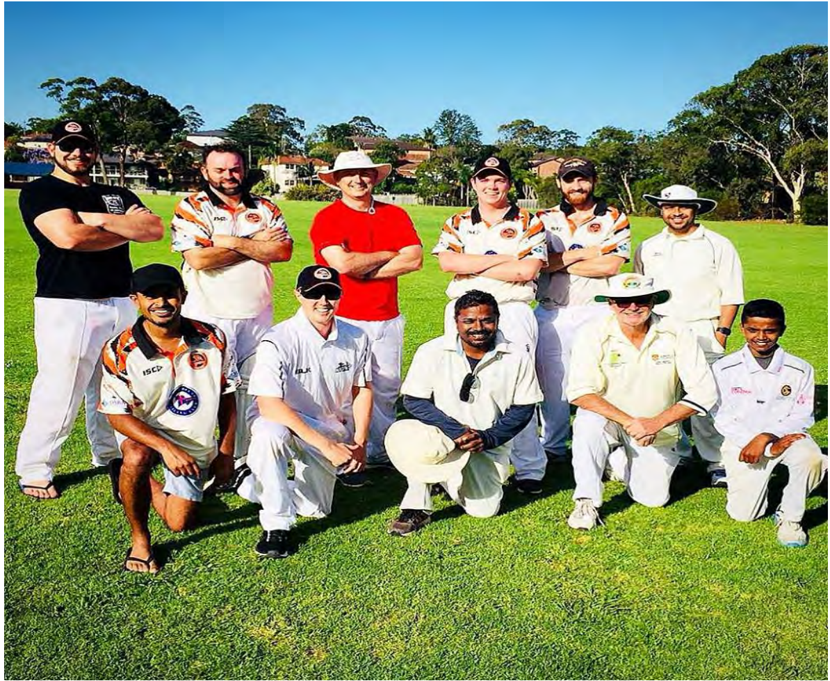
TIGERS 3 C GRADE AT GANNAN PARK