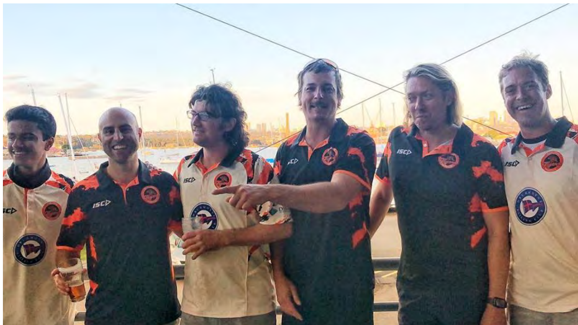
THE BOYS AT DRUMMOYNE SAILING CLUB AFYERT THE GAME