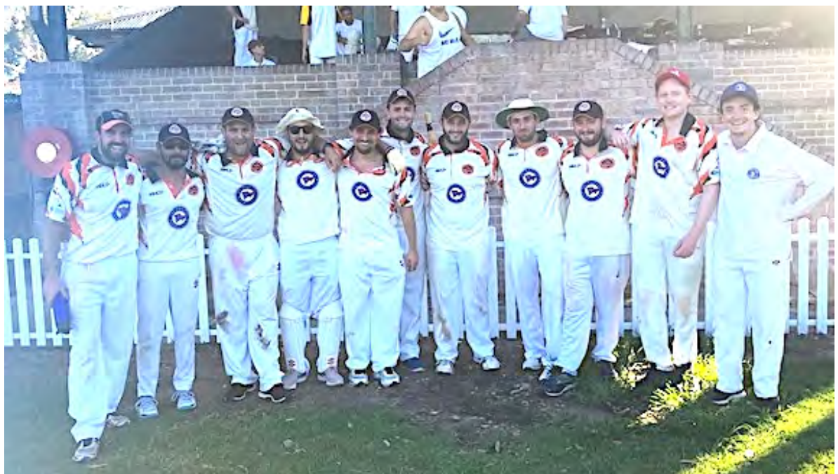
A/B GRADE TIGERS 2 AT MONASH PARK AFTER BEATING GLADESVILLE SPORTIES